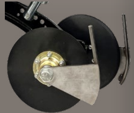
OPTIONAL LIQUID FERTILIZER KIT

Available with smooth or serrated closing disc options.