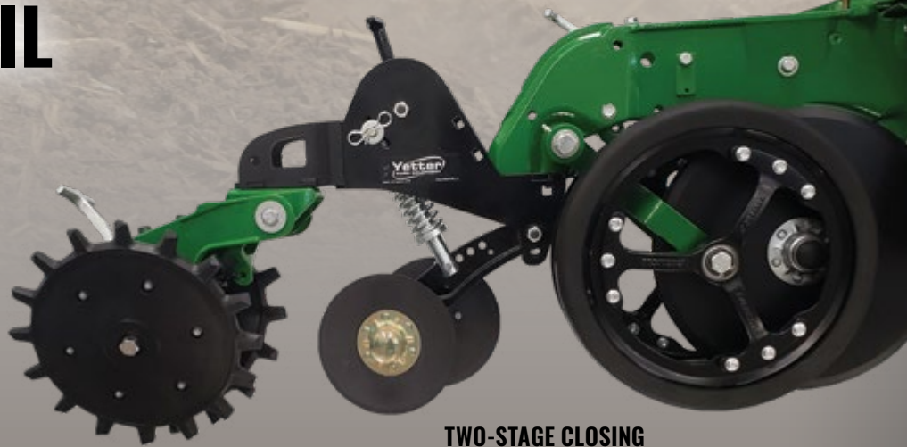
TWO-STAGE CLOSING SYSTEM WITH V CLOSING WHEELS

Available with smooth or serrated closing disc options.