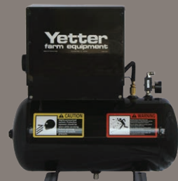
12-gallon electric compressor