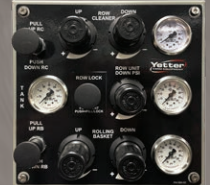
2984 Strip Freshener CC in-cab controller