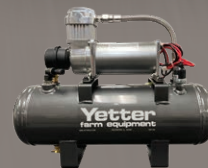
2-gallon electric compressor