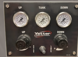
Planter/toolbar control box