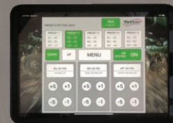
Wi-Fi controls for tablet or iPad