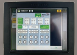
Existing ISOBUS option