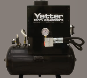
12-gallon hydraulic compressor