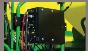
Existing onboard compressor