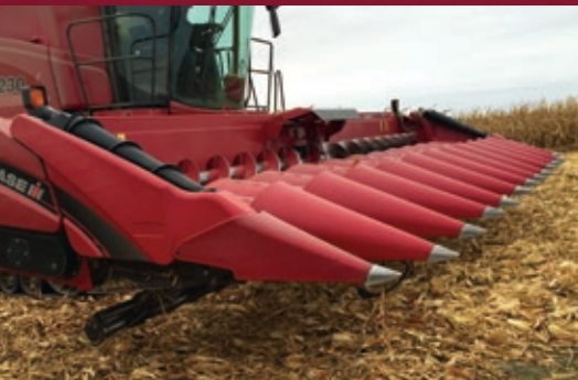
CASE IH 4412