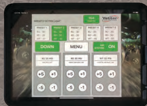
Wi-Fi controls for tablet or iPad