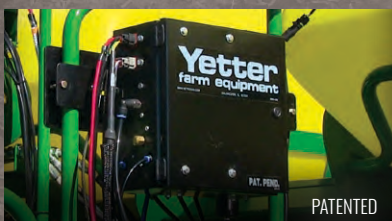
PNEUMATIC HYDRAULIC CONTROLLER KIT