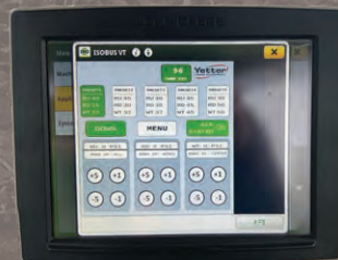
John Deere ISOBUS option