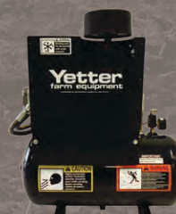
HYDRAULIC PNEUMATIC COMPRESSOR KIT