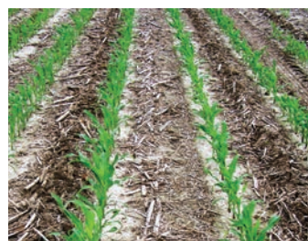
Clearing the way for consistent seeding depth and even emergence