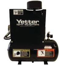
2940 Hydraulic Compressor