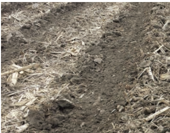
Moving residue out of the row without engaging too much soil

Row cleaners top the list when it comes to planter upgrades. Properly set row cleaners improve planter performance and seed emergence by: