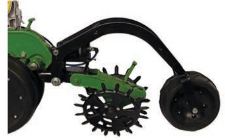
2940 Firming Wheel