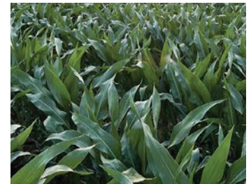
Delivering ROI through better crop stands and higher yields

LOOKING FOR TIPS ON SETTING AND ADJUSTING YOUR ROW CLEANERS?