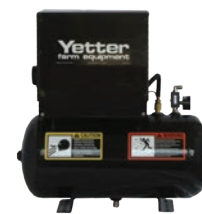
2940 Electric Compressor