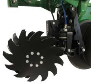
2940 Firming Wheel