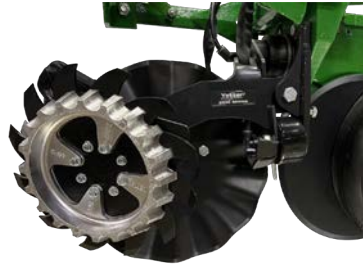
2940 Coulter/Row Cleaner Combo