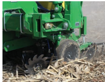
Creating a smooth ride for gauge wheels, reducing planter bounce